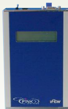
Flow meter C09-10vFlow