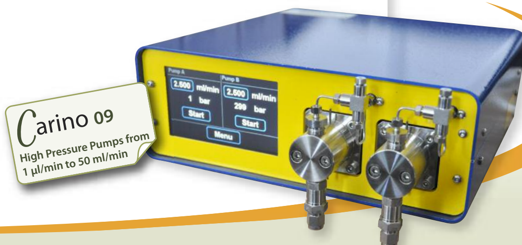
Carino 09 High Pressure Pumps from 1 µl/min to 50 ml/min